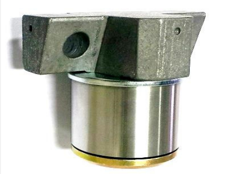
KIT REPARACION ARMADO